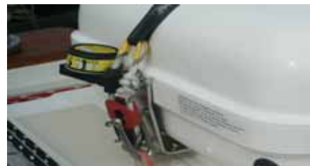
Deck mount with HRU