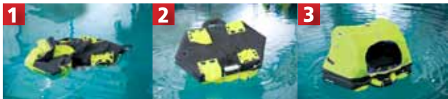
The automatically self-righting VIKING RescYou™ Pro is ready for boarding within seconds